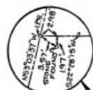
DETAIL SCALE: 1" = 10'

N/F AMOS T. & LILLIAN R. WATERS DB. 452, PG. 231