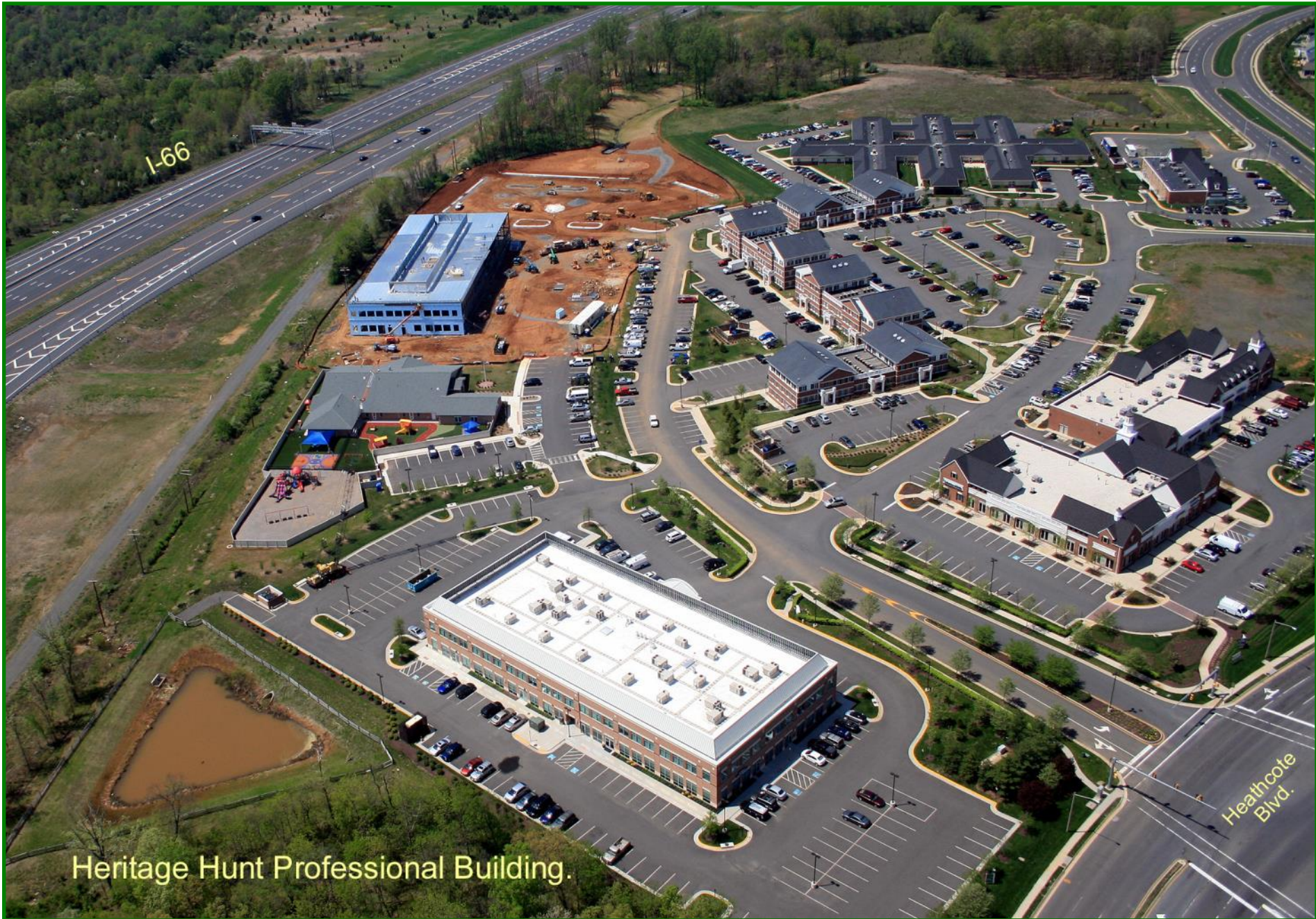
Heritage Hunt Professional Building.