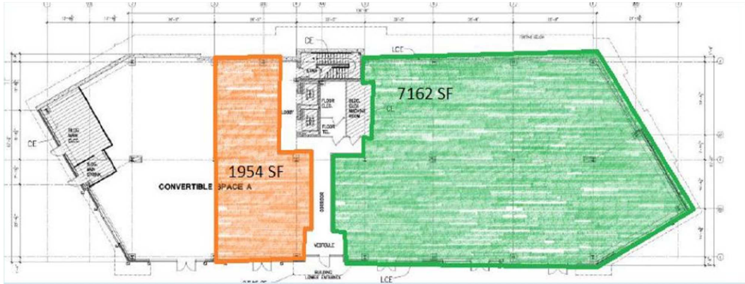
Suite 101 Suite 103